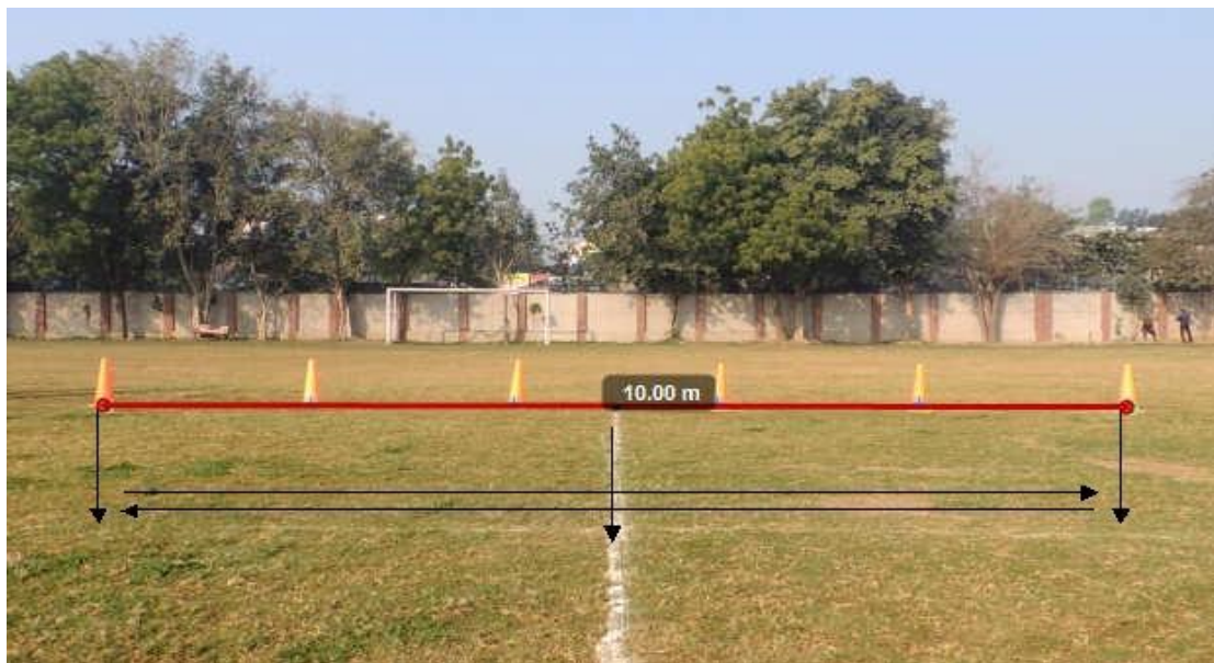
Figure- 1 Course of Zigzag Sprint and Dribbling Performances

The data was computed with mean, standard deviation and t- test. The hypothesis was tested at 0.05 level of significance.