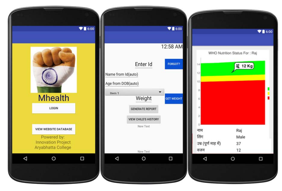
Figure IV: Login and output screen