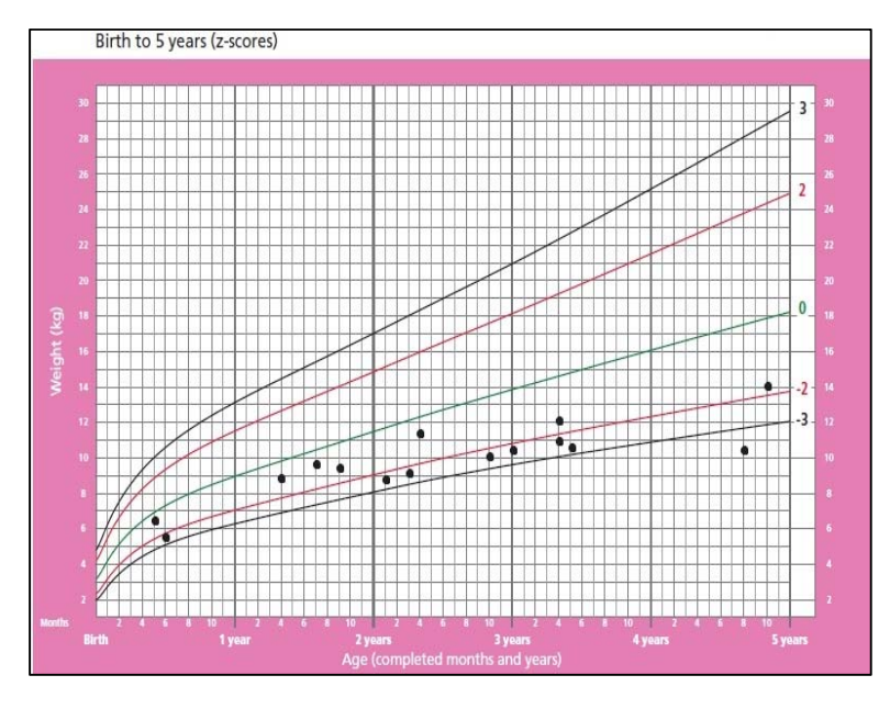
Figure VI: Graphical representation of z-score values of Girls (< 5 years of age)